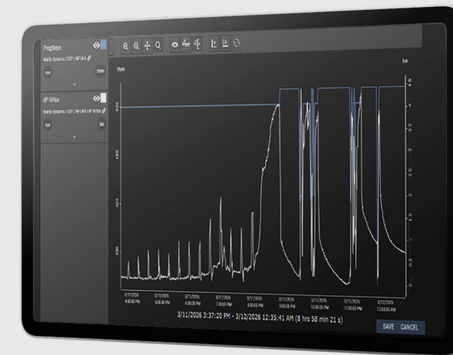
fig 2 ← Trending Progsteps and dP Hiflux over time - The increasing pressure drop across the HiFlux pre-filter indicates fouling and, if left unchecked, can eventually cause the unit to stop production and switch to hold mode, which should be avoided.